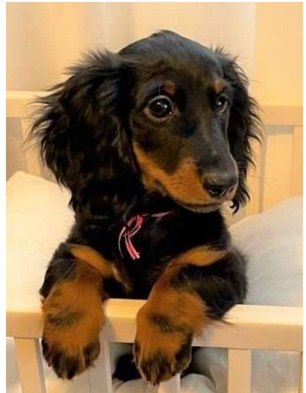
Beautiful little Abby is home in Minnesota being spoiled by her very proud pet-parents.

In January he started limping and had become very lethargic. His limping was rapidly progressing and within 24 hours he could barely walk, and was unable to even lift his head! He went to the doctor for a medical exam, and upon his diagnosis the doctor began treating him for his illness. As you might guess, this story is not about Charles Darwin, the famous scientist, but Darwin, a four-year-old English Sheep Dog. Initially, the doctor took x-rays and they confirmed Darwin did not have any fractures or bone cancer. However, the blood work showed that Darwin had Lyme disease. Amazingly, Darwin responded well to treatment and after three days he was nearly back to his normal self. The scary part is that Darwin had not traveled anywhere and had stayed home for weeks in his urban neighborhood prior to his diagnosis. Thanks to his pet-parents' quick action and the veterinarian's quick diagnosis and treatment Darwin is happy, healthy and enjoying life today.